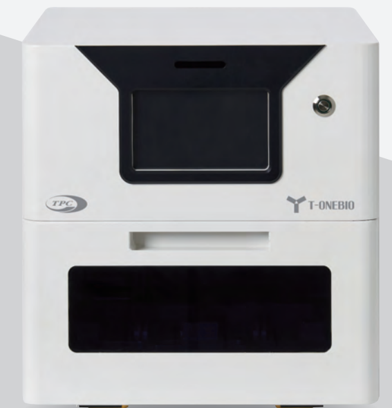
Magnetic Bead Separation