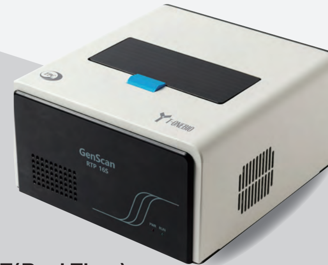
RT(Real Time)- PCR